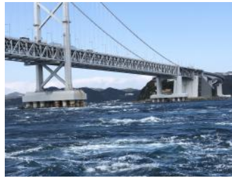
Onaruto Bridge & whirlpools