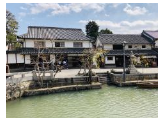
Kurashiki Historical Area

We will make couple 5-4-4- stops at the service area on the toll way.