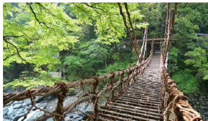
Iya Vine Bridge