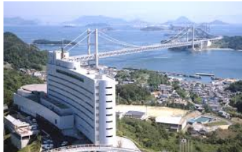
Kurashiki Setouchi Kojima Hotel