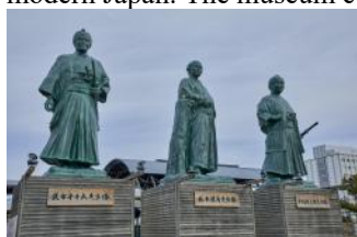
Sakamoto Ryoma Statue