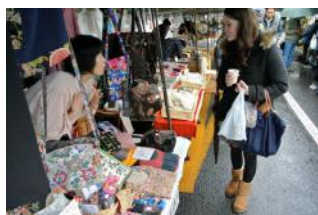
Sunday Morning Market