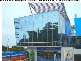
Sakamoto Ryoma Museum