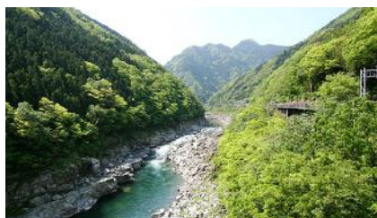
Countryside of Oboke Kobo