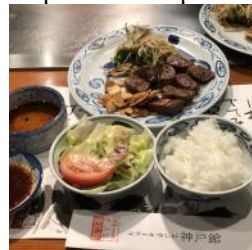
Kobe Beef Teppanyaki Lunch

After Himeji, continue on to KOBE (HYOGO). Kobe is the sixth-largest city in Japan and the capital city of Hyogo Prefecture.